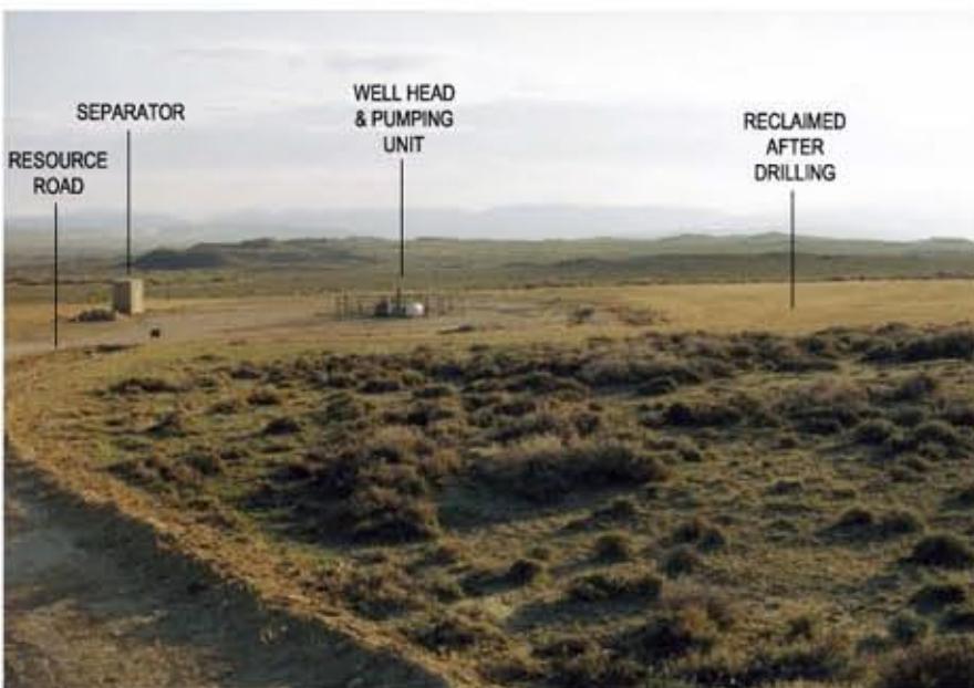
TYPICAL PRODUCING WELL PAD SITE. WELL HEAD, PROPANE TANK AND MOTOR IN CENTER. WATER/GAS SEPARATOR BUILDING ON LEFT. NOTE RECLAMATION ON WELL PAD, MAINLY ON THE RIGHT. RESOURCE ROAD ACCESSES SITE ON LEFT SIDE OF PHOTO.