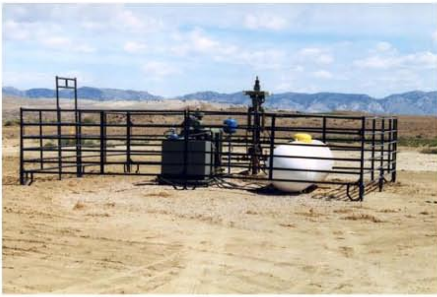
EXISTING WELL HEAD AND PUMPING UNIT AT PILOT PROJECT, SURROUNDED BY LIVESTOCK FENCING. WHITE TANK IS PROPANE TANK. PROPANE USED IN "MOTOR" - GREEN COLORED ENGINE LOCATED TO LEFT OF WELL HEAD. DURING PILOT PROJECT, PUMPING UNITS POWERED BY PROPANE. ELECTRIC POWER WOULD BE USED IN BUILD-OUT, SO PROPANE TANK AND PROPANE MOTOR WOULD BE REMOVED.