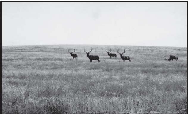
Elk on Reclaimed Rangeland Jacobs Ranch Mine, Wyoming