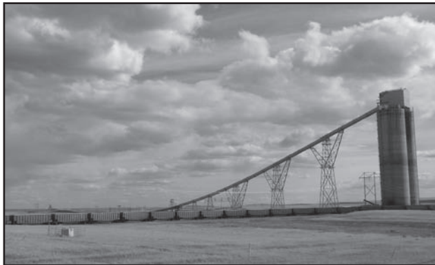
West Loadout Facilities Black Thunder Mine, Wyoming