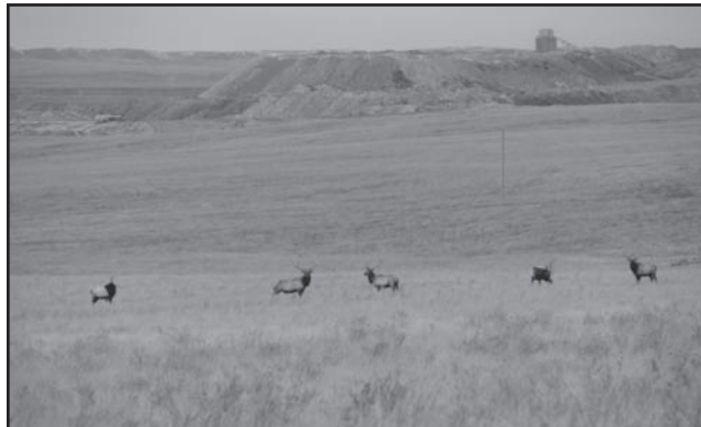
Elk on Reclaimed Rangeland Black Thunder Mine, Wyoming