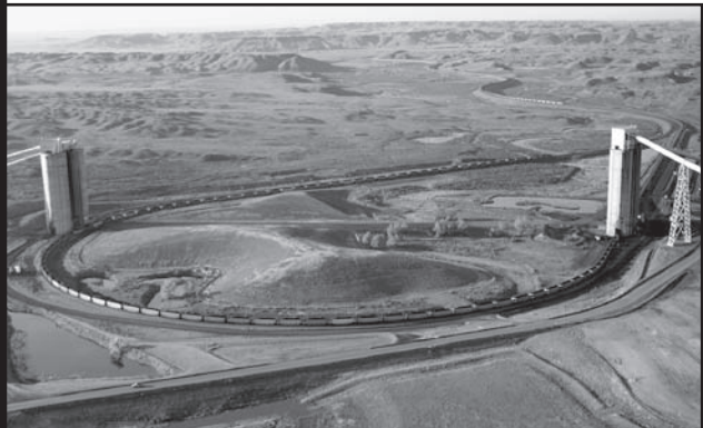
Loadout Facilities in Porcupine Creek Valley North Antelope Rochelle Mine, Wyoming