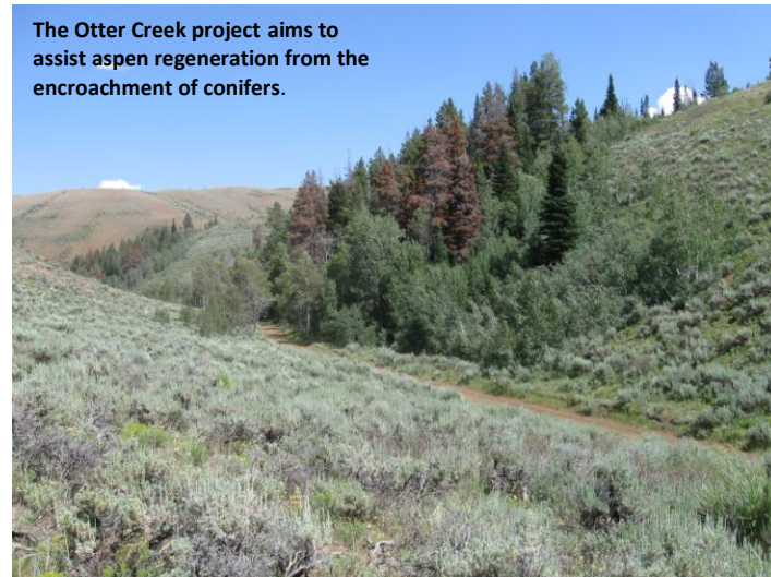
The Otter Creek project aims to assist aspen regeneration from the encroachment of conifers.

Rich County has nine Communities at Risk from wildfire. Laketown is a community in Rich County that has formulated a community wildfire protection plan. The mayor, residents and commissioners have been proactive community implementing a fire plan in conjunction with the State of Utah and the BLM. For their efforts, the community was awarded a National Fire Plan grant to mitigate fuels on areas identified surrounding the community.