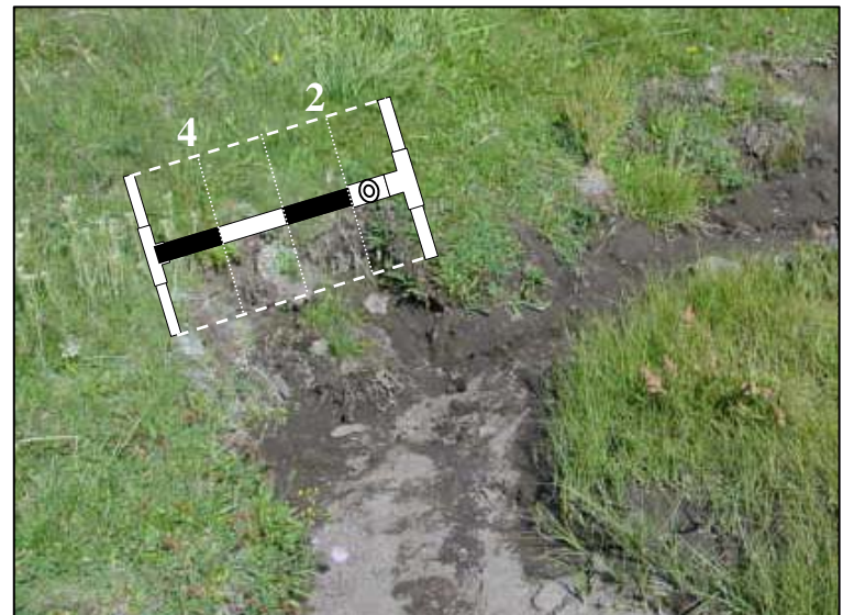
Figure 7 —lines 2 and 4 intersect streambank alteration caused by livestock. Two is recorded.