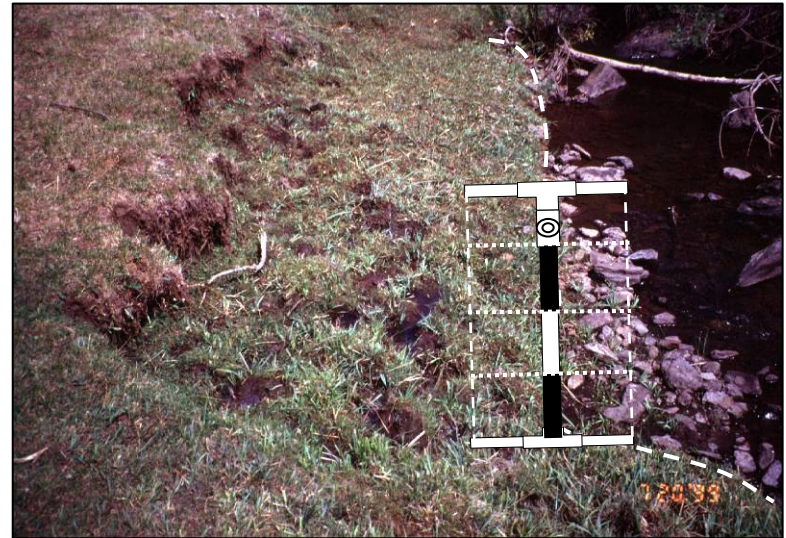
Figure 6 —no evident streambank alteration intersects any of the lines within the plot. Zero is recorded.