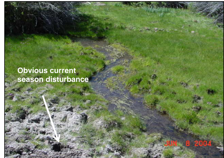
Figure 8 —current streambank alteration can be difficult to distinguish from previous season's use. Streambank alteration measurements should be made while livestock are still in the pasture or within two weeks of use. Streambank alteration should not be conducted on a site such as this where the current season's impacts are difficult to distinguish from previous seasons.