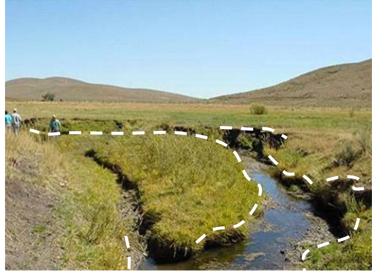
Figure 11 —in the case of a peninsula, or back-water channel, the greenline jumps across the backwater channel to the inner bank of the peninsula.