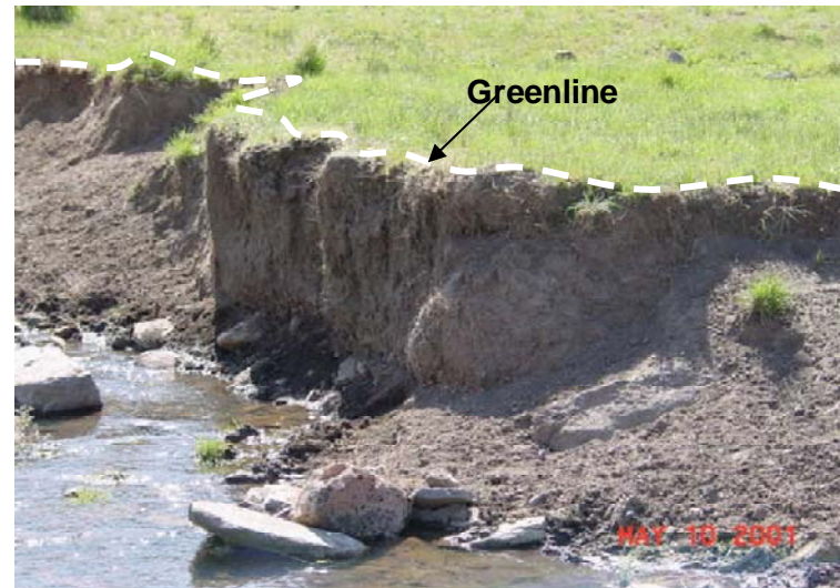
Figure 14 —for steep, bare banks, the greenline is at the top. Vegetation does not have to be “hydraulic” to be included as part of the greenline.