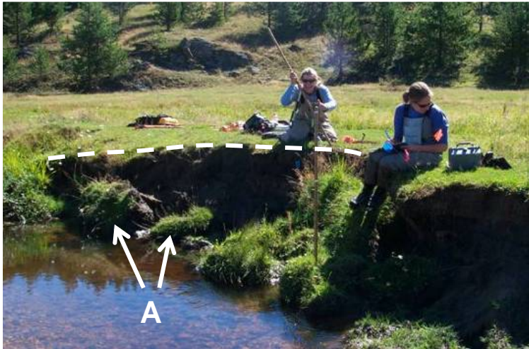
Figure 16 —slump blocks “A” are detached and not considered part of the greenline. The dashed line shows greenline.