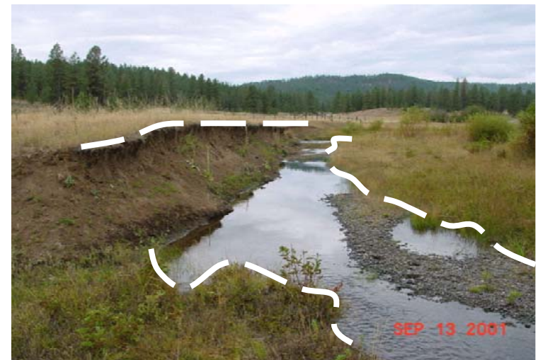
Figure 13 —greenline on the left side of the photo is in two segments, the lower segment near the water's edge and the upper segment along the edge of the terrace with upland vegetation. The greenline on the right side of the stream is continuous along the perennial vegetation.