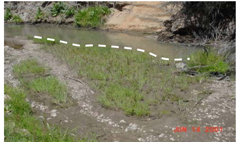
Figure 10 —colonizing species short-awned fox tail ( Alopecurus aequalis ) forming a lineal grouping of vegetation with at least 25% foliar cover; it is at least 6 inches (15 cm) wide and 19.6 inches (50 cm) long.