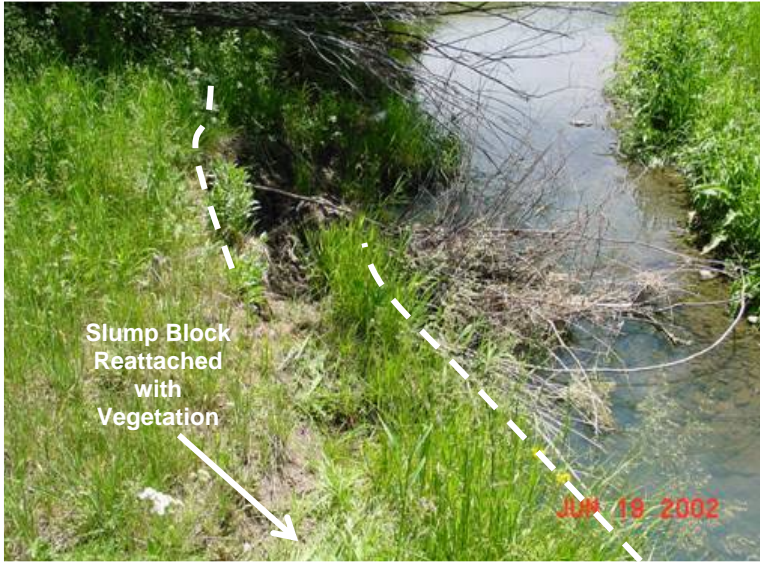
Figure 17 —slump block re-attached to the bank with vegetation.