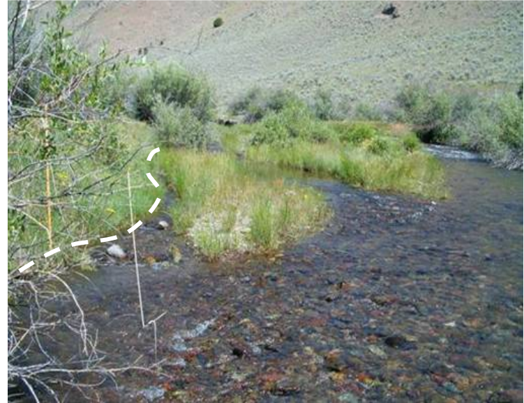
Figure 9 —the greenline follows the outer streambank at bankfull. It does not cross a channel to the island. A small channel runs along the island on the left.