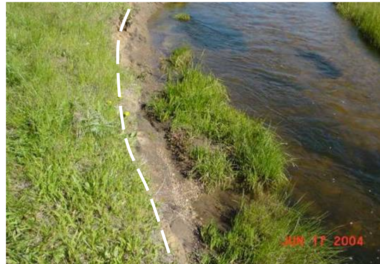
Figure 19 —vegetation is not well established between the slump block and the terrace; thus, the greenline follows the bank behind it.