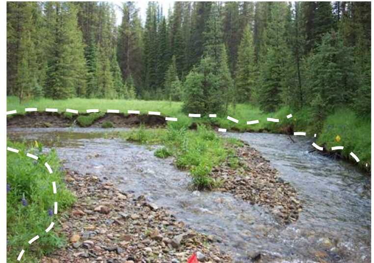
Figure 12 —the island, even with vegetation, is not part of the greenline.