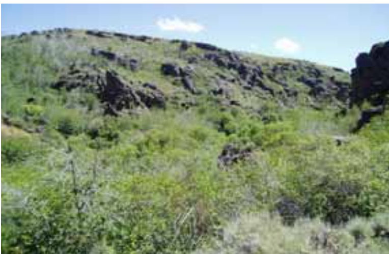
Figure 2. Cherry Creek SS-1 located near the stateline.

A total of six sample sites were slated for survey on Cherry Creek during July 7-8 (Appendix II). Only SS-1 was not surveyed due to the extreme density of riparian vegetation (Figure 2).