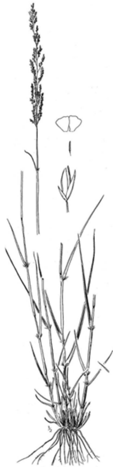
Sporobolus cryptandrus ⑤ Sand Dropseed