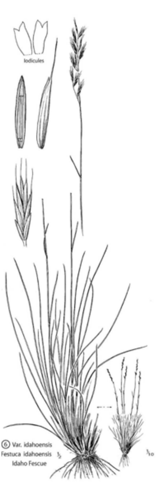
⑥ Var. idahoensis Festuca idahoensis Idaho Fescue