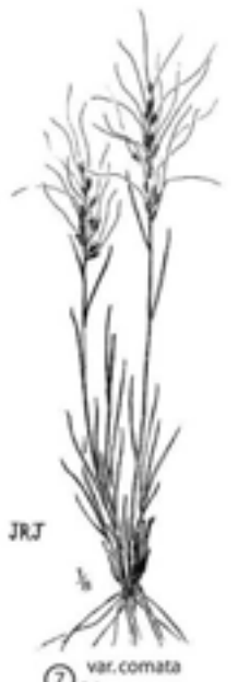
⑦ var. comata Stipa comata Needle & Thread Grass