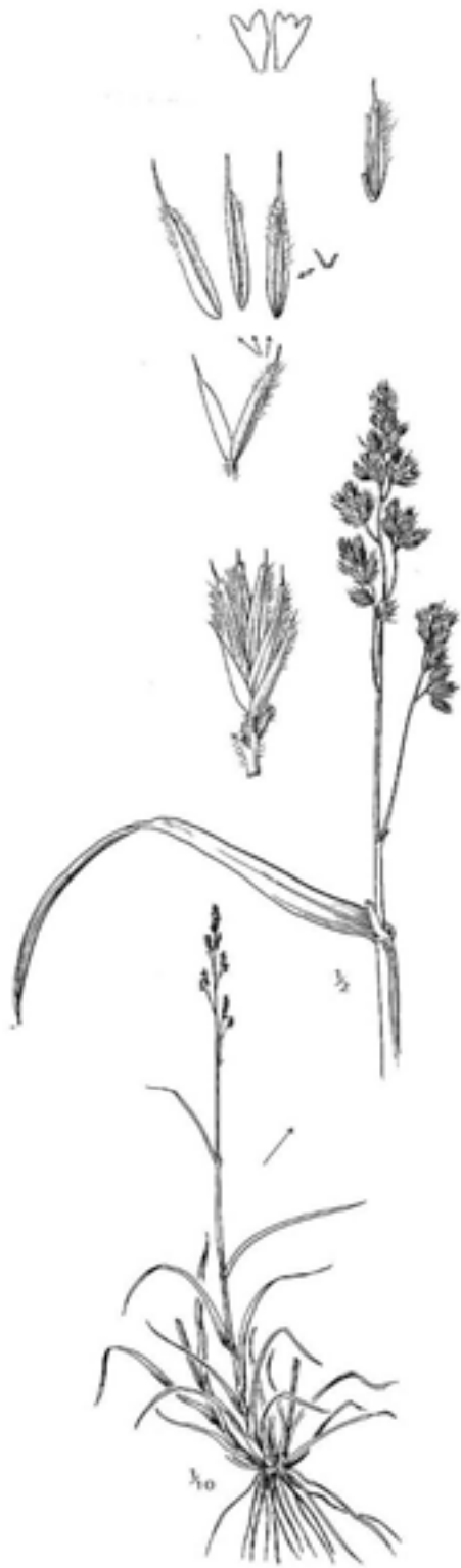
Dactylis glomerata ⑨ Orchardgrass