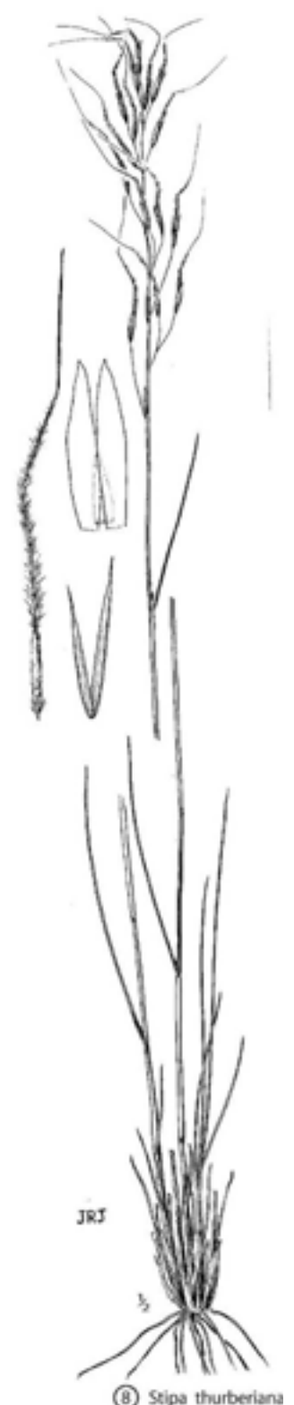
⑧ Stipa thurberiana Thurber's Needlegrass