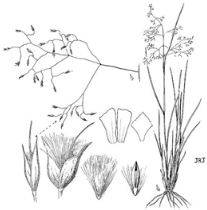
⑩ Oryzopsis hymenoides Indian Ricegrass