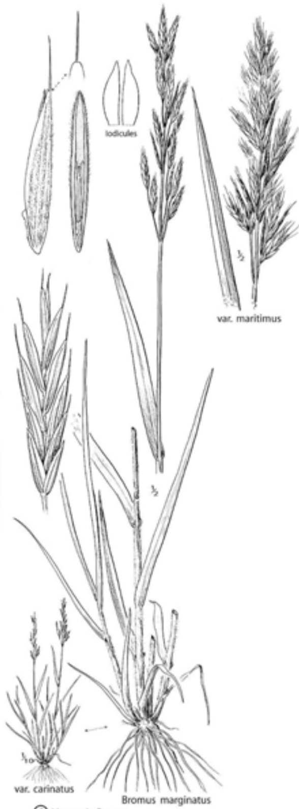
④ Mountain Brome