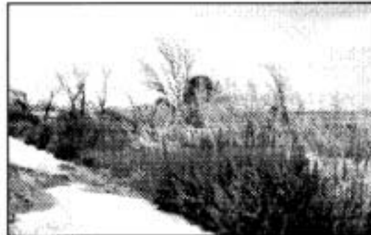
Figure 23. Irrigation runoff from 20-Mile Farm near the Sand Creek Sec. 23 nesting territory, 31 July 2000.