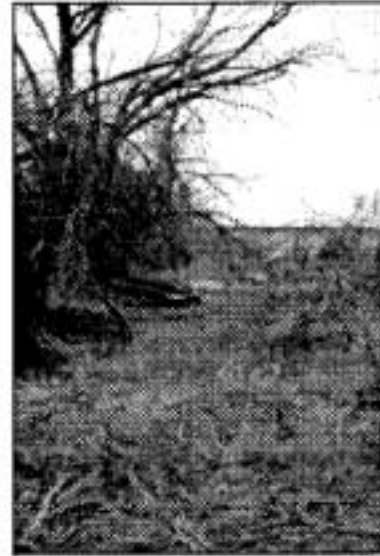
Figure 21. Dead willow trees along Sand Creek near the Sand Creek Sec. 23 nesting territory, 31 July 2000.