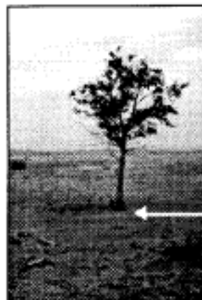
Figure 19. Elm tree showing cattle damage in the Kuna Butte Sec. 13 nesting territory, 31 July 2000. Note the rubbed bark and lack of vegetation around the roots.