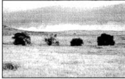
Figure 3. Kuna Butte SE nest trees, 31 July 2000. Nest tree in 1999 on the right and 2000 nest tree on the left.