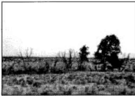
Figure 5. Sand Creek Sec. 23 nest tree, 31 July 2000. Nest tree on the right.