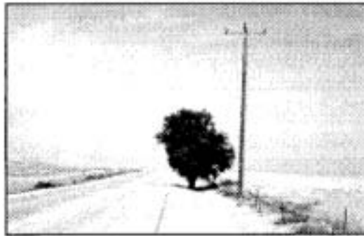
Figure 7. Swan Falls-Nicholson nest tree, 31 July 2000.