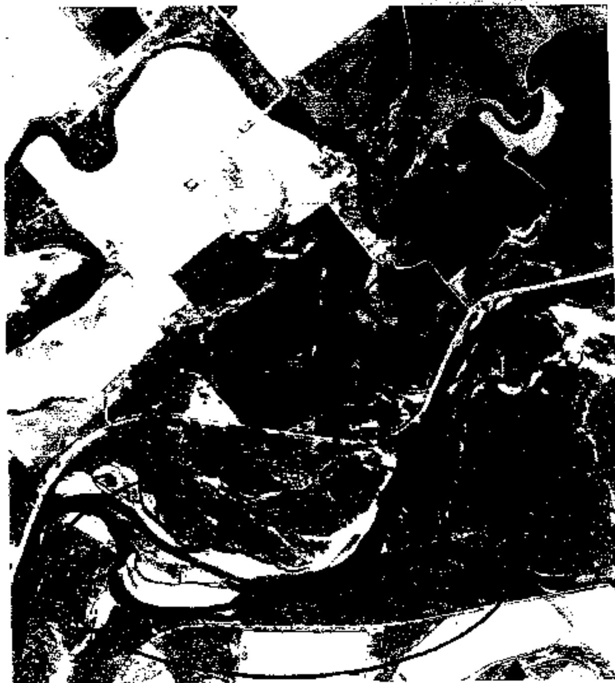
Figure 4. Known key use area within the Menan Buttes bald eagle breeding area, South Fork Snake River. Intensive monitoring has not occurred at this breeding area, and the information portrayed is preliminary only. The circle encloses the Principal Management Area (PMA). The star indicates the current nest site. Dots and numbers indicate prominent foraging perches/locations determined in 1998 observations. (Two historic alternate nests in an old heron rookery approximately 3/4 mile upriver of current nest are not shown within the PMA. The area of the historic alternates should also be managed as a part of the PMA.)