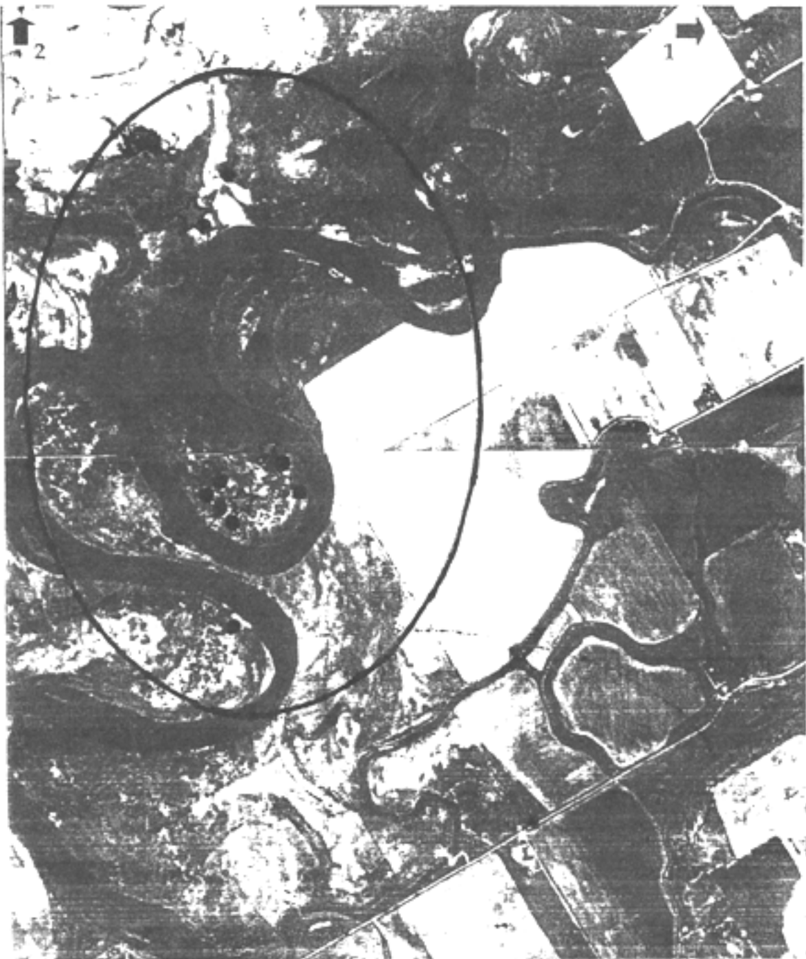
Figure 5. Known key use area within the Cartier Slough bald eagle breeding area, Henry's Fork Snake River. Intensive monitoring has not occurred at this breeding area, and the information portrayed is preliminary only. The circle encloses the Principal Management Area. The three stars indicate the known nest sites, the highest and lowest of which are still intact. (The 1998 nest was the lowest star.) The numbers refer to primary foraging perches and locations. Perch 1 is 1.5 miles southeast of the photo; perch 2 is 2.2 miles to the northeast.