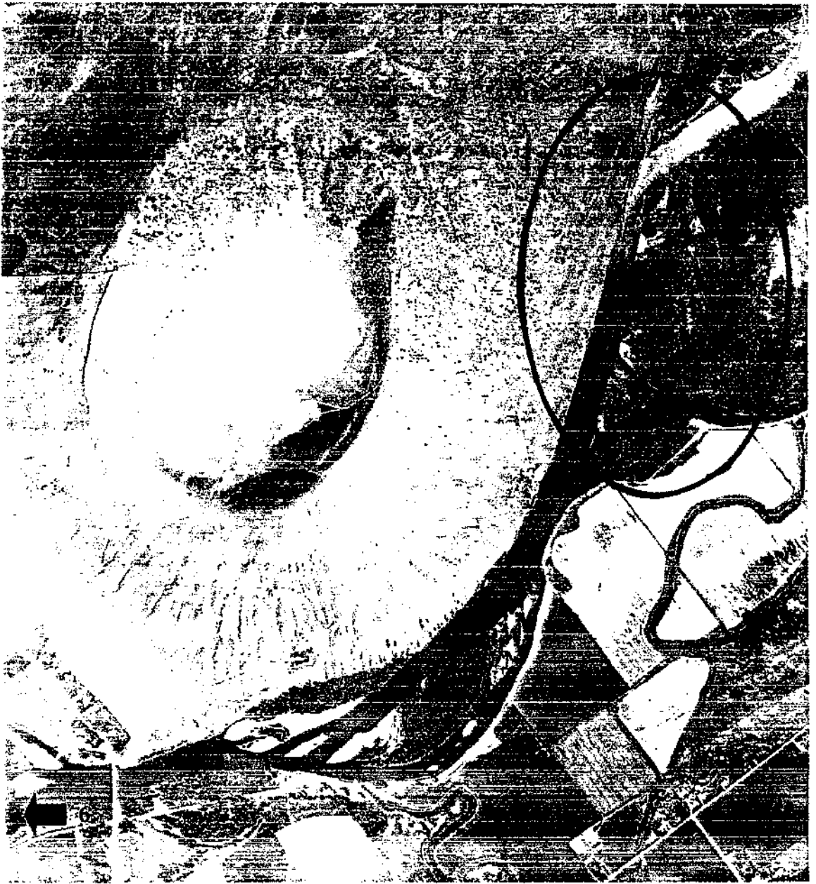
Figure 6. Known key use area within the Annis Slough bald eagle breeding area, Henry's Fork Snake River. Intensive monitoring has not occurred at this breeding area, and the information portrayed is preliminary only. The circle encloses the Principal Management Area. The star indicates the only known nest site. The numbers indicate primary foraging perches used by the adults during the nesting season. One primary perch not shown in this figure is located downstream below the Menan Bridge over the Snake River in a small cottonwood stand on the south side of the river.