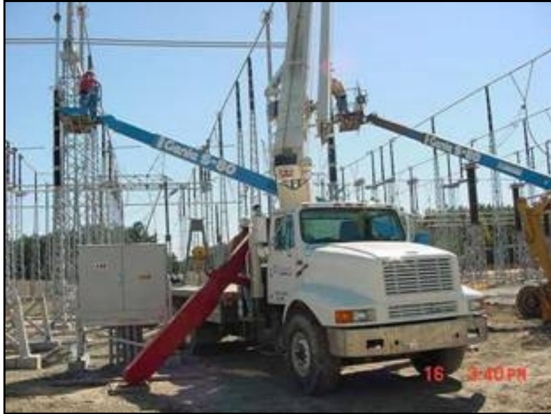
Figure 3-13. Substation Buswork Construction.