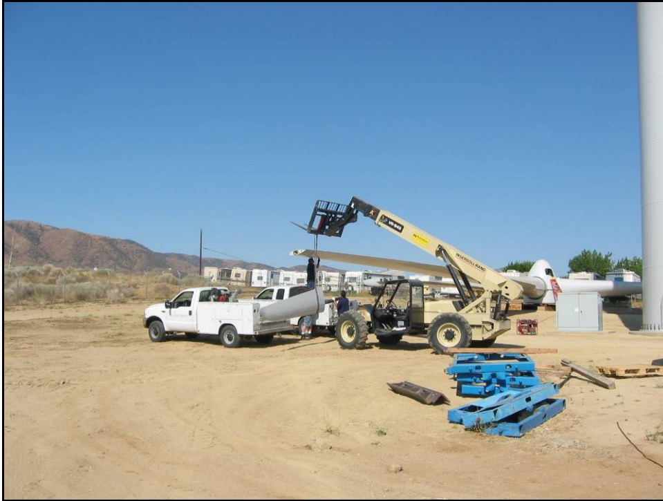
Figure 3-16. Rotor Assembly.