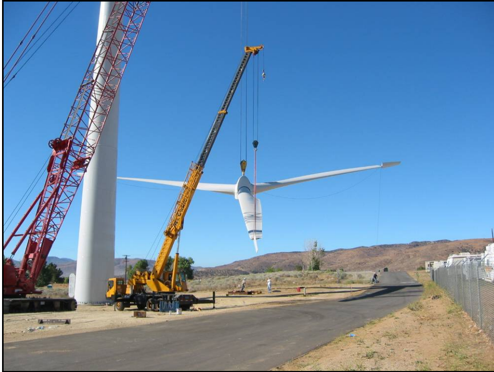
Figure 3-20. Complete Rotor Pick-Up.