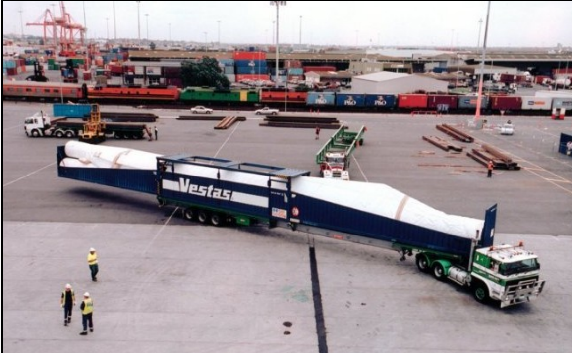
Figure 3-8. Wind Turbine Blade Delivery Truck.