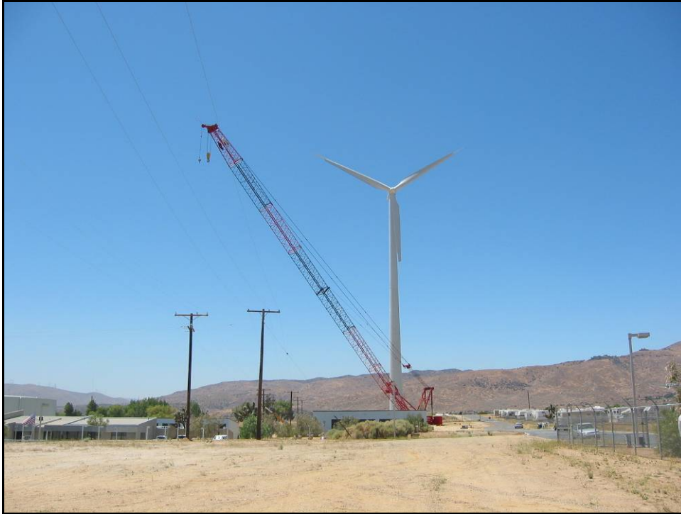
Figure 3-4. Wind Turbine and Crane.

planned laydown arrangements. Crane crews will erect the turbines soon after all components arrive to minimize the amount of time the equipment is on the ground. The only exception may be if components begin to arrive in the spring before the site is available for construction (due to snow on the site, or sage-grouse lekking). In such an instance, some components may be temporarily stored near the O&M facility site until full project site access is available.