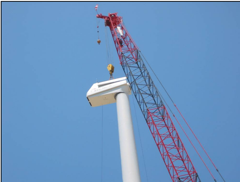
Figure 3-19. Nacelle Placement.