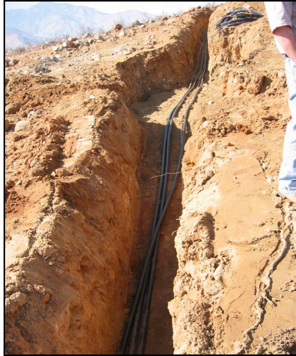
Figure 3-11. Open Trench Example.