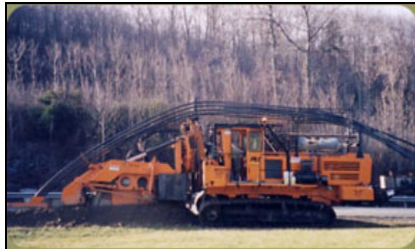
Figure 3-12. Trenching Machine Example.

Potential environmental impacts during buried cable placement include: