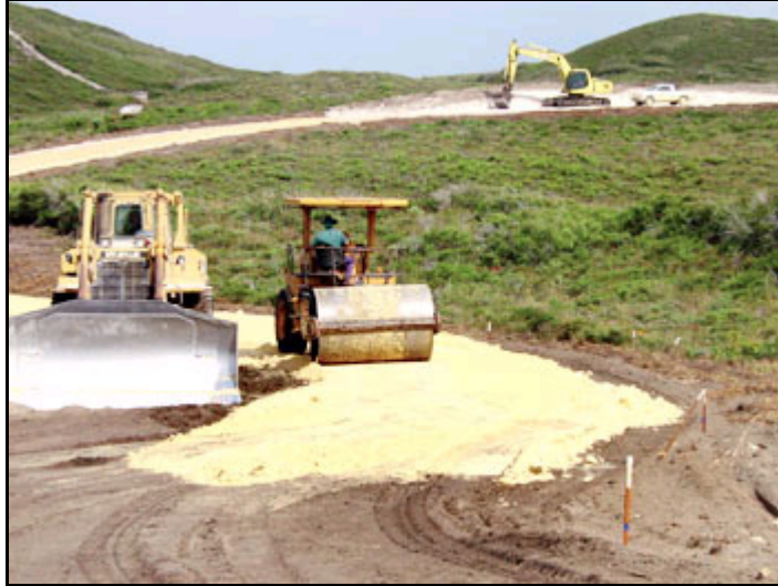
Figure 3-1. Turbine Access Road Under Construction.

The access road will provide vehicular access (construction and maintenance) to the following permanent and temporary areas associated with the project: