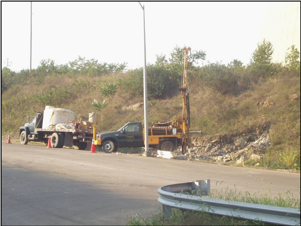
Figure 3-9. Typical Coring Truck and Support Vehicle.