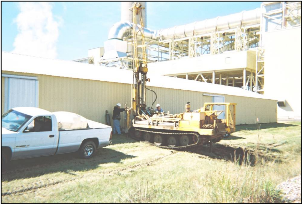
Figure 3-10. Typical Coring Tracked Vehicle.