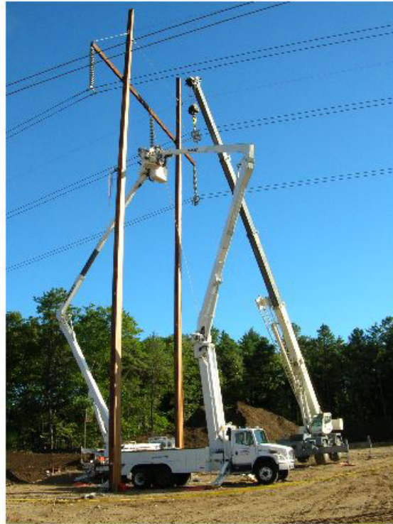
Figure 3-6. Transmission Line Under Construction.