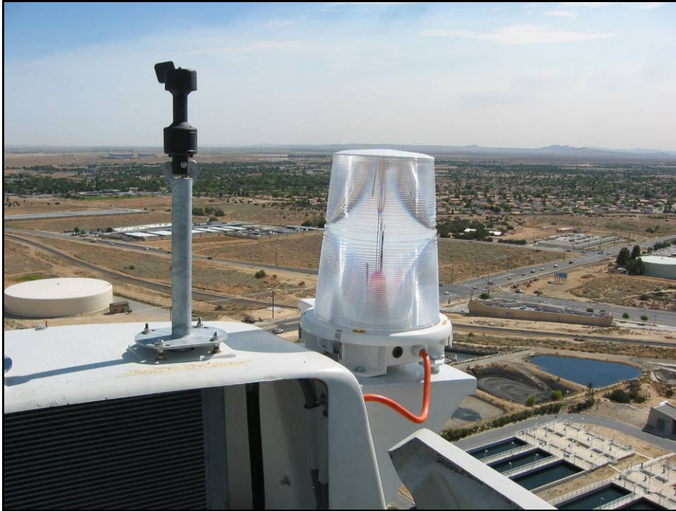
Figure 3-14. Typical Aviation Warning Light.

There are no environmental impacts expected for the installation of the lights themselves. The lights will be installed on top of the nacelles, thus partially shielding their light from sight on the ground while maintaining full visibility to aircraft. The operation of the wind turbine with the lights installed is considered in Section 4-2 (note the light shown above is mounted on the side of the nacelle, in a configuration different from that to be used on Cotterel Mountain).