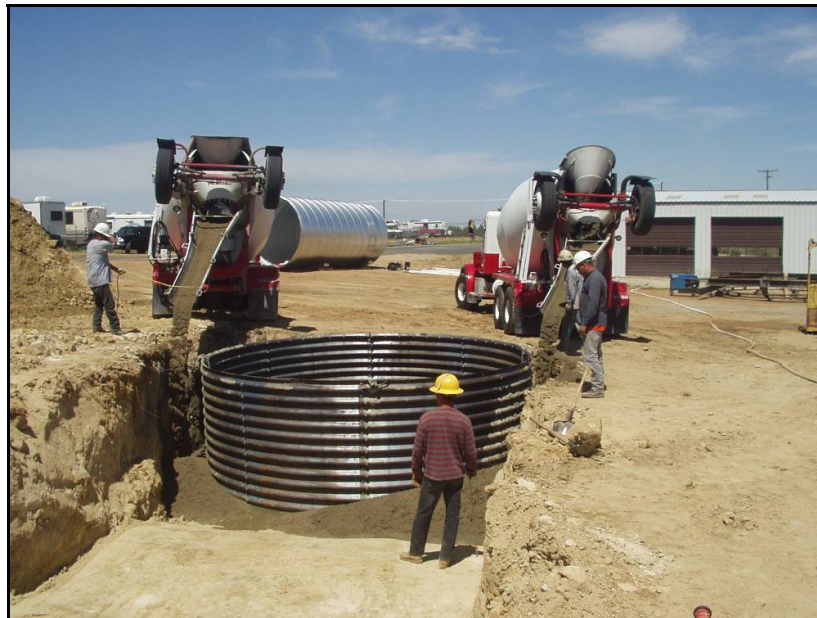
Figure 3-3. Pier Foundation Installation.