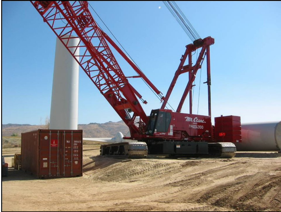
Figure 3-17. Tracked Crane on Crane Pad.