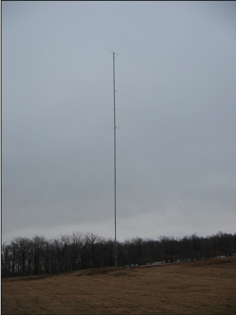
Figure 3-5. Meteorological Tower.