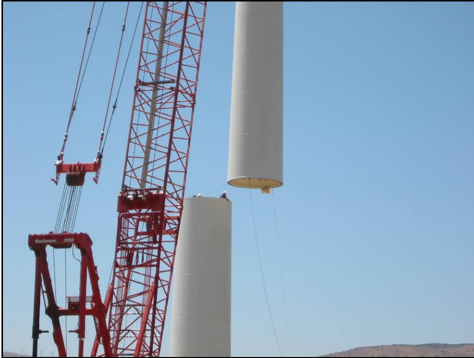
Figure 3-18. Mid-Section Tower Assembly.