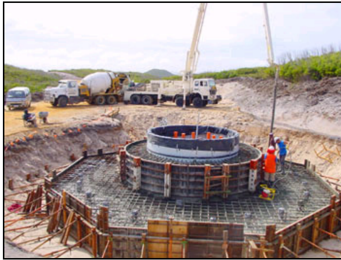
Figure 3-2. Mat Foundation Installation.

Two foundation designs are typically used for wind turbine installations in the U.S., the specific one for the project being determined by the soil conditions and wind turbine requirements. The first foundation type is a “mat” foundation, and is shown in Figure 3-2. The second foundation type is a “pier” foundation, and is shown in Figure 3-3. Mat foundations are wide and shallow, and pier foundations are narrow and deep. There are variations on these foundations. The exact foundation type is dependent on completion of the geotechnical investigation. Under known conditions most foundations will be pier design.