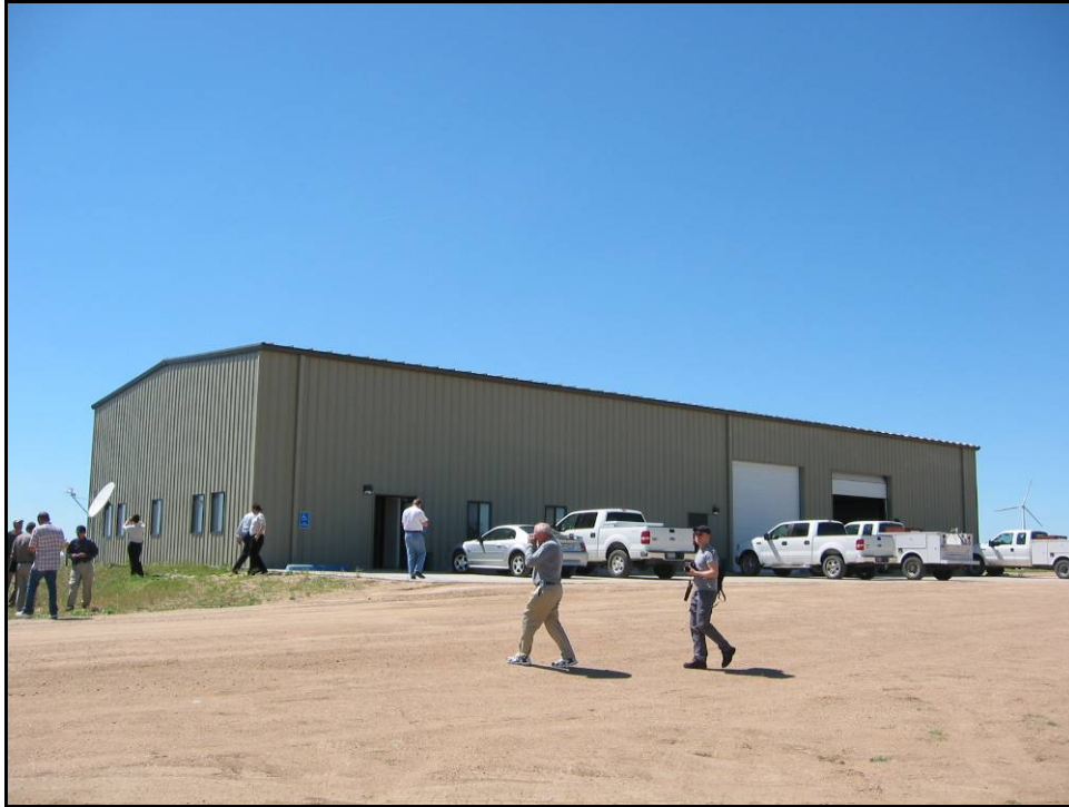
Figure 3-7. Typical Wind Energy Facility O&M Building.