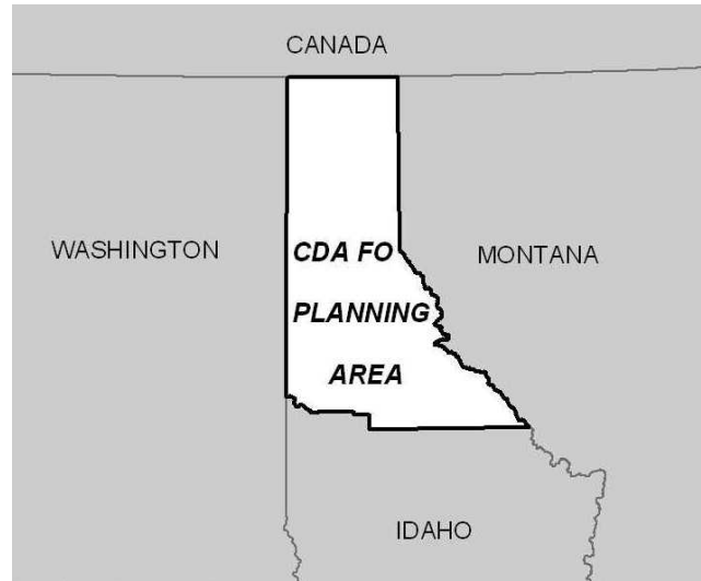
Figure 1. Coeur d'Alene Field Office Planning Area