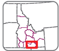
US Dept. of the Interior Bureau of Land Management Twin Falls District, Idaho