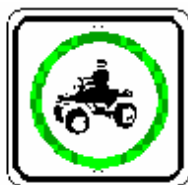
FR 17-1 18" X 18" (w/green circle)

SEASONAL CLOSURE (with dates): This sign will first show the modes of travel that are allowed on the road under the words “Open To”. Below these, the modes of travel that are restricted will be shown with red-slashed symbols under the words “Seasonal Closure”. The dates of the restricted travel will be shown below the symbols.