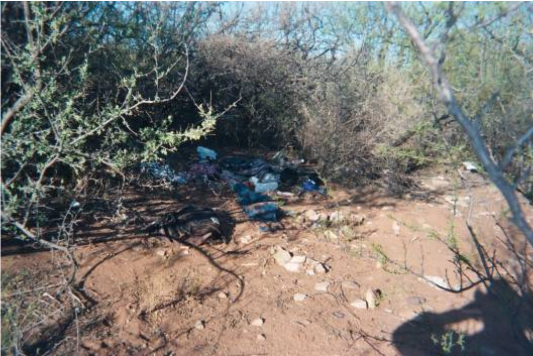
Before (above) and After (below)