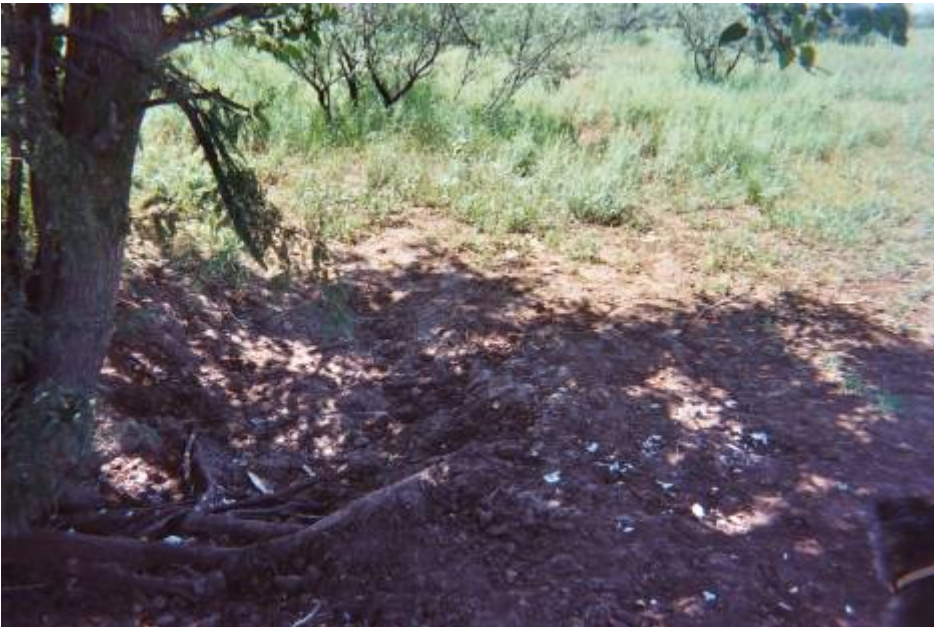
After trash removal and clean-up