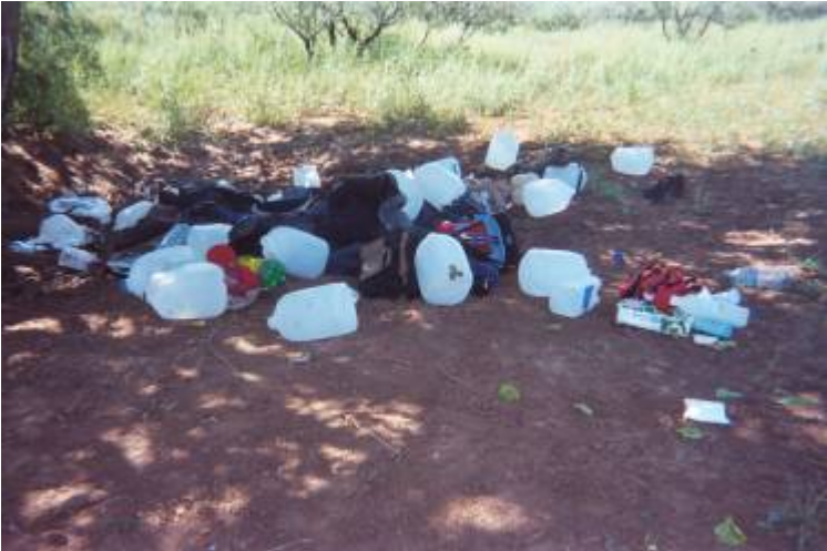
Before trash removal