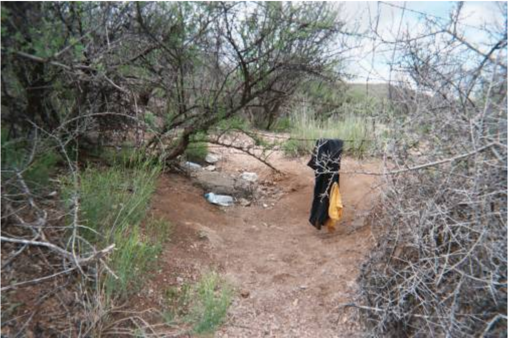
At the International Border Before (above) and After (below)