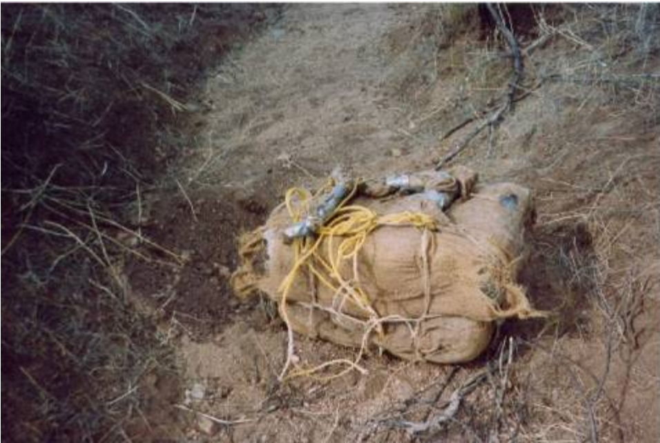
Marijuana pack (above) and trash site encountered by visitors to the borderlands