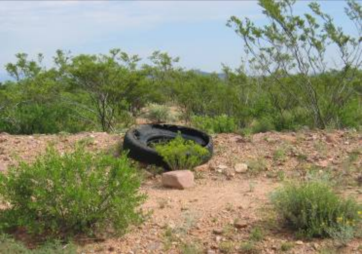
Trash Removed: Worn tires left from road dragging