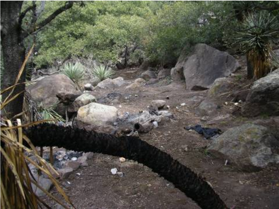
Near Spring in mountains (above); spring in mountains (below)