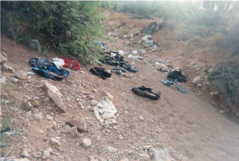
Trail Clean up: Before (above) and After (below)