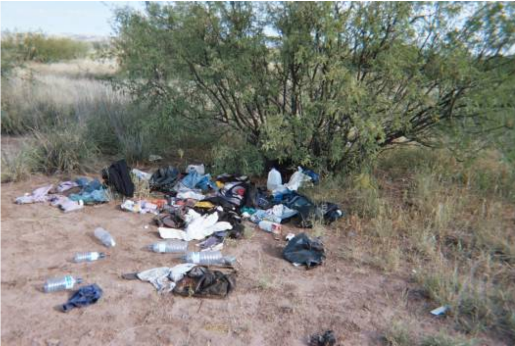
Rest Stop Clean Up: Before (above) and After (below)