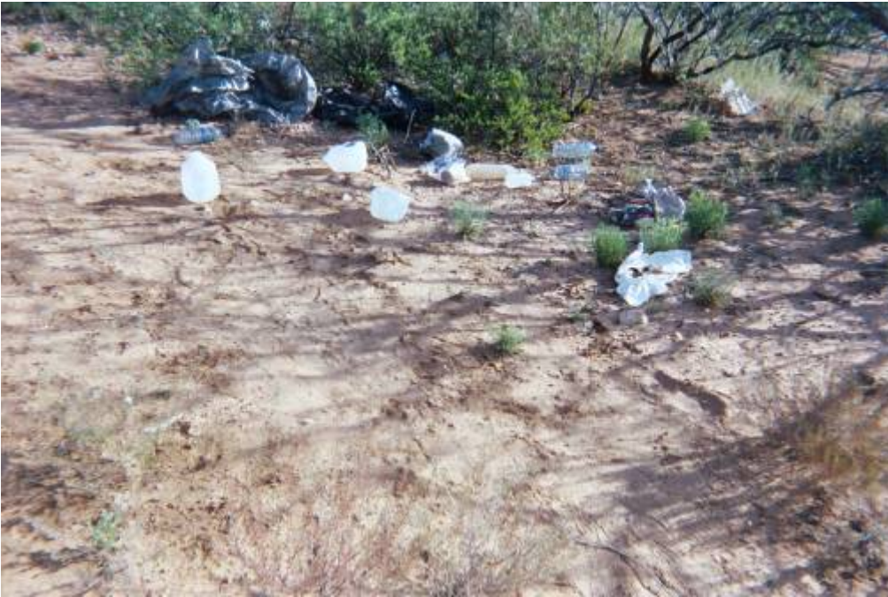
Before (above) and After (below)