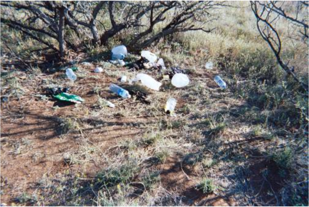
Before (above) and After (below)