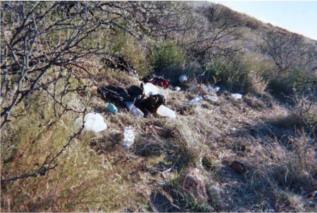
Before (above) and After (below)