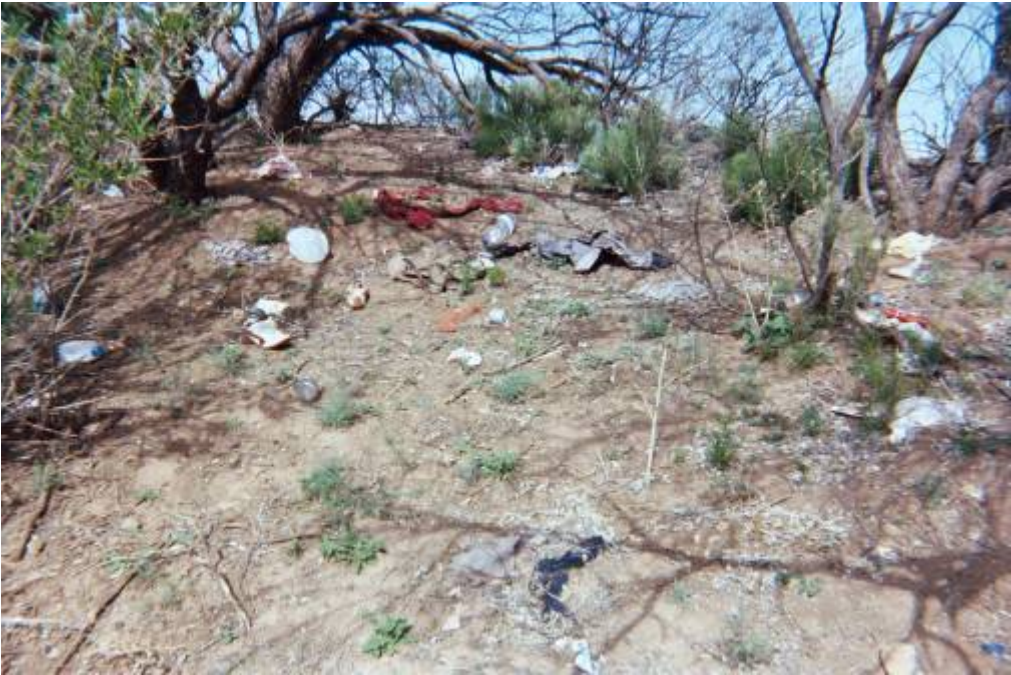
Before (above) and After (below)