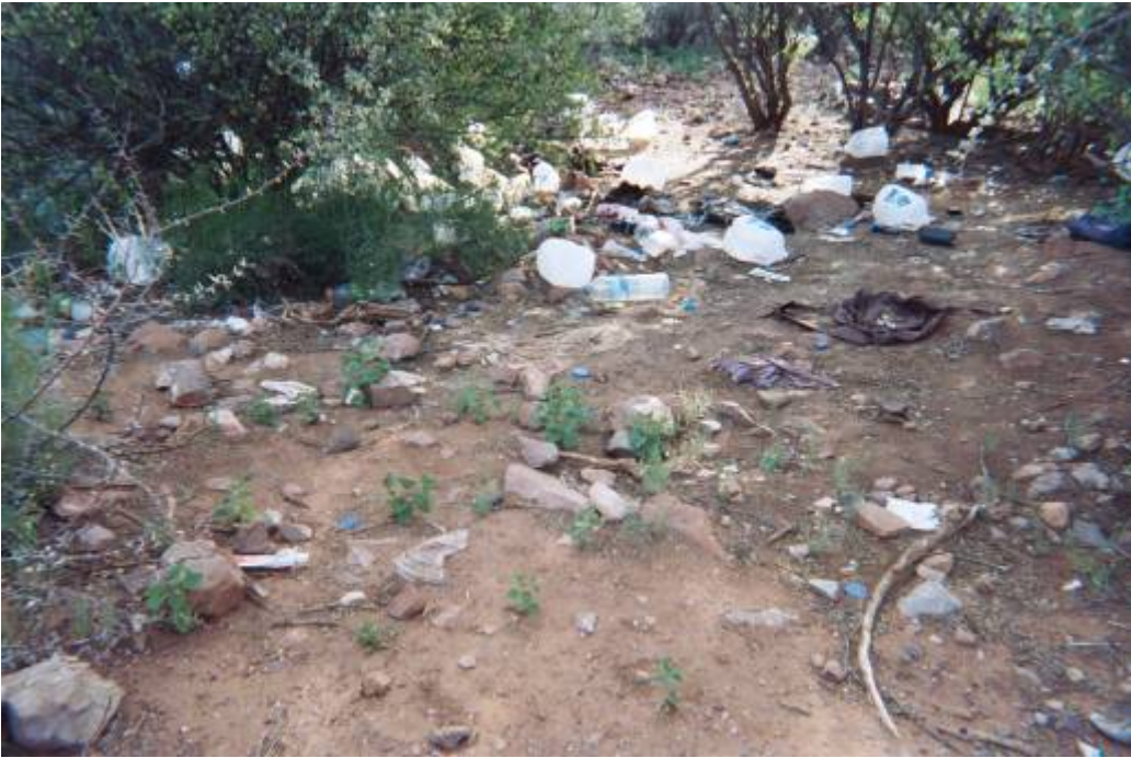
Before (above) and After (below)