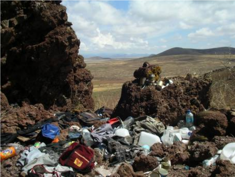
MBG: archaeological site covered by UDI trash