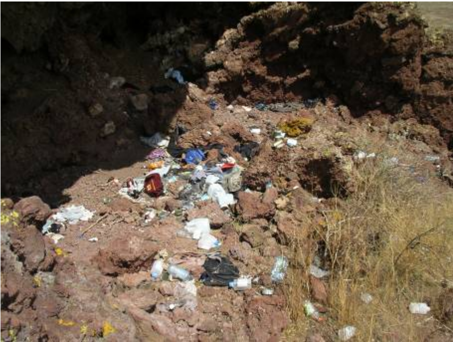
MBG: archaeological site covered by UDI trash