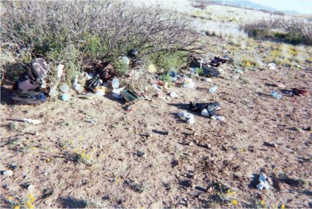
Before (above) and After (below)