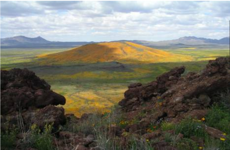
MBG: area with archaeological sites