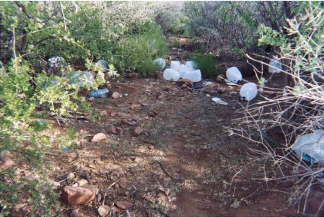
Before (above) and After (below)