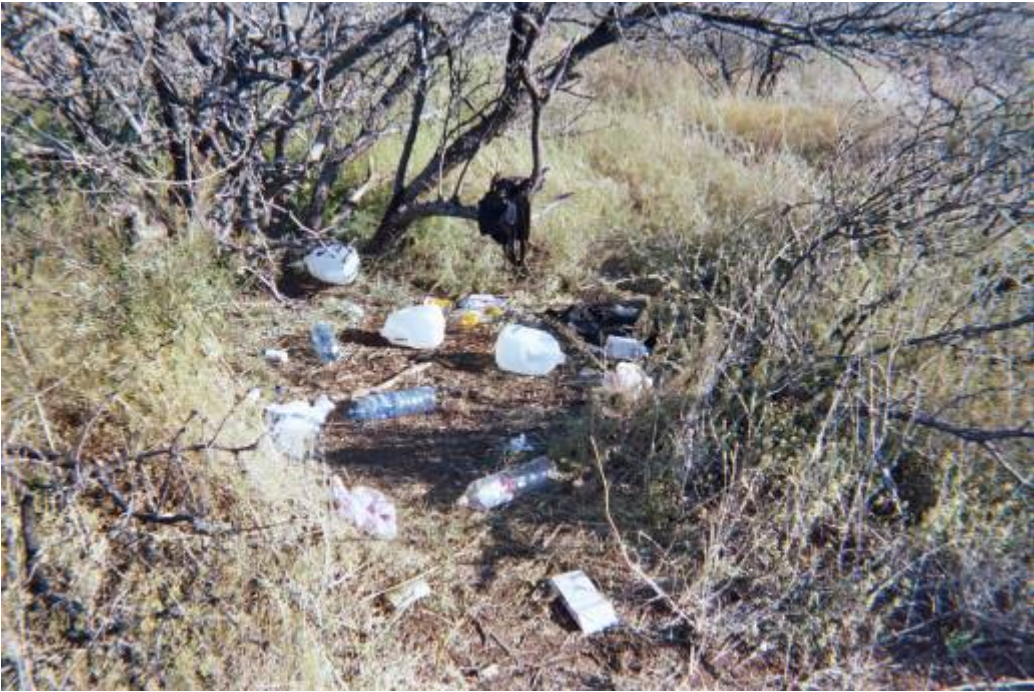
Before (above) and After (below)