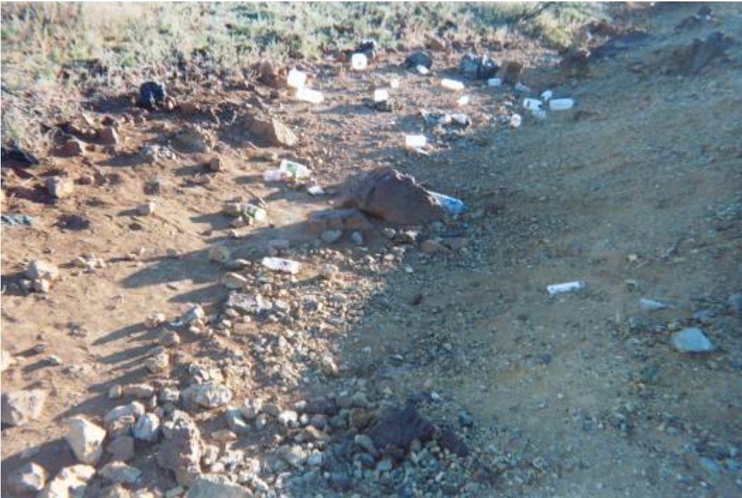
A new trail is cleaned up: Before (above) and After (below)