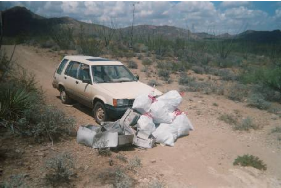
Malpais Borderlands Group: Trash Removal