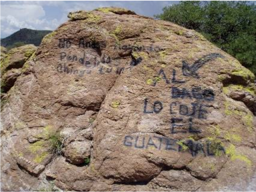
Rock defacement: Anti-Border Patrol (above) Wildcat road (below)