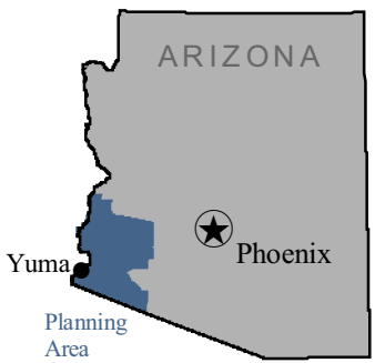
Map 3-7: Lower Colorado River Riparian Vegetation, North Area

U.S. DEPARTMENT OF THE INTERIOR Bureau of Land Management Yuma Field Office April 2008