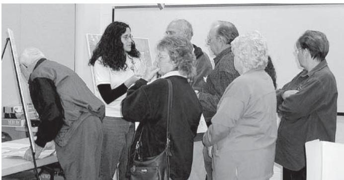
The 11 public scoping meetings held in February and March 2003 were a success with 367 individuals attending.

The comments were compiled, reviewed, and analyzed to identify the preliminary issues that will be addressed in the RMPs and EIS. The results are available in a Scoping Report, which documents the scoping process, planning criteria, and issues identified. The Scoping Report is available on the BLM planning web site at www.az.blm.gov . The document is also available through an exciting new pilot program called e-Planning, which provides an interactive web site where project-related documents will be available for viewing or downloading. You are encouraged to provide comments using e-Planning, which is available through the BLM web site. If you don't have access to the Internet, copies of the Scoping Report also are available in the Phoenix Field Office's public room, located at 21605 N. 7 th Avenue (south of Deer Valley Road) in Phoenix, Arizona, from 7:30 a.m. to 4:15 p.m. Monday through Friday.