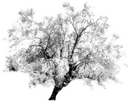
Ironwood Forest National Monument Proposed Resource Management Plan and Final Environmental Impact Statement (PRMP and FEIS)