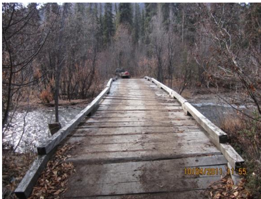
Bridge on Suslositna Creek trail