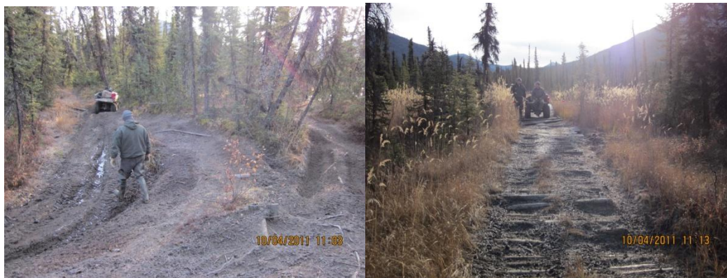
Suslositna Creek trail

If this alternative is chosen, a recommended condition would be to require that a single sign shall be placed at the beginning of the Suslositna Creek trail systems which states that all trails are maintained privately and travel is conducted at the risk of the user.