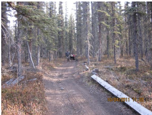
Typical Trail Conditions Segment B

The construction of proposed route F would increase the overall footprint of the trail network in the Suslostina Creek drainage. The issuance of a ROW twenty feet in width over approximately one eighth mile of trail would create .30 acres of new ground disturbance. This route would be duplicative in nature providing access to segment D, which is already accessed by two trail segments, segments C and B.