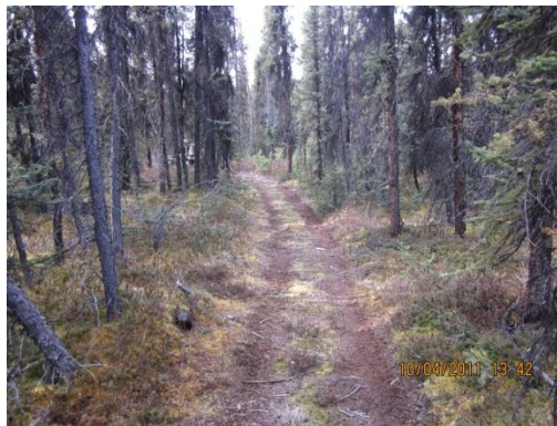
Typical Trail Conditions Segment C

Travel intensity and associated effects (soil displacement, erosion, and soil compaction) would be reduced on segments C and B if route F was constructed. Essentially it would offer a third route to segment D in addition to segments B and C. The construction of segment F, if constructed in similar fashion to existing trails in the area, would be subject to some erosion, incising, and trail braiding in low lying areas.