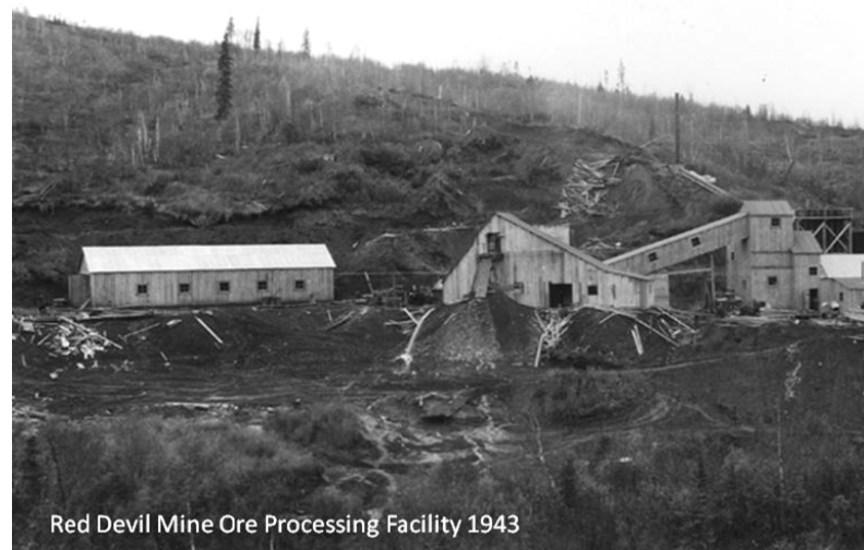
Red Devil Mine Ore Processing Facility 1943

The Red Devil Mine is one of many cinnabar mines that once operated in Alaska. The mine operated from 1939 until 1971 and was a world-class producer of mercury. Since 1987 the mine has been the subject of numerous environmental investigations and cleanups.