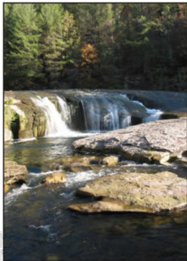
South Umpqua Falls