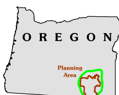
Map 4.1.1: Cumulative Effects Area

No warranty made by the Bureau of Land Management as to the accuracy, reliability, or completeness of these data for individual or aggregate use with other data. Original data were compiled from various sources. This information may not meet National Map Accuracy Standards. This product was developed through digital means and may be updated without notification.